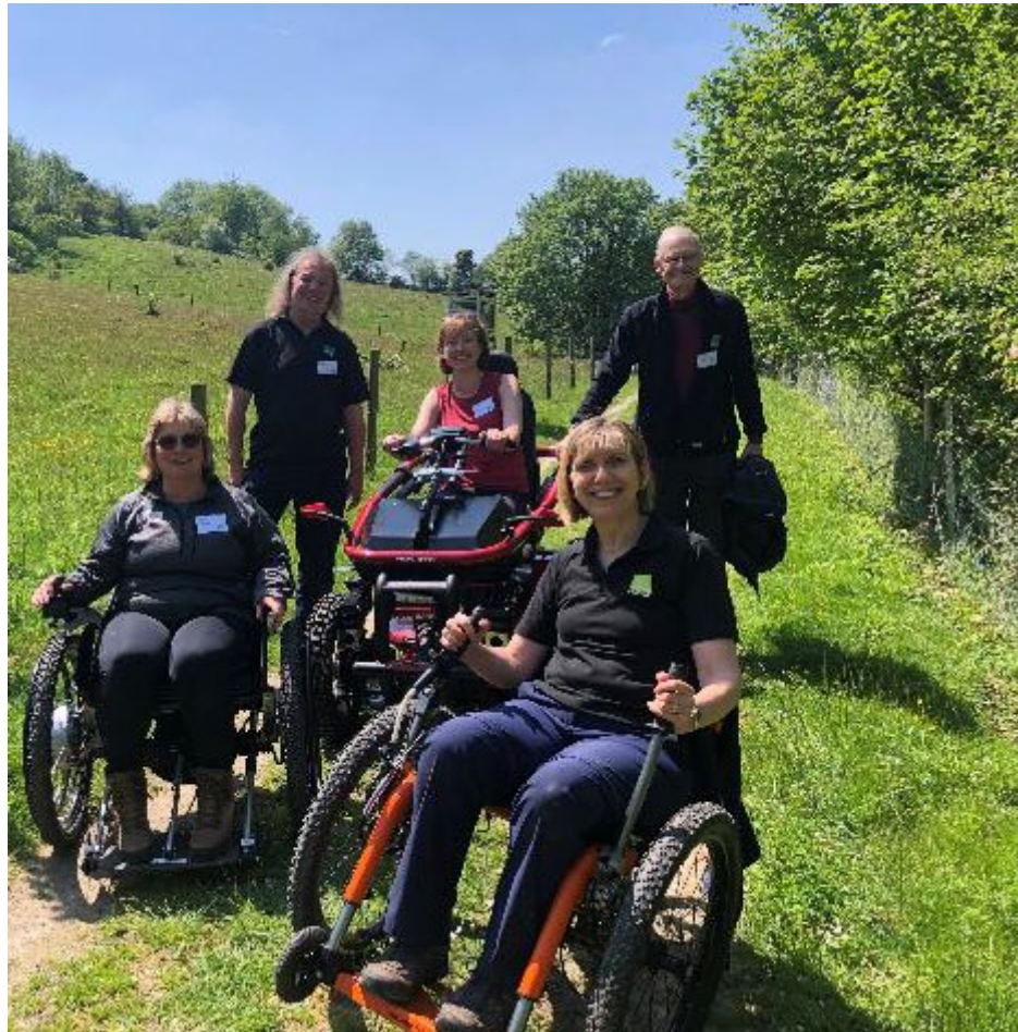
New mobility vehicles at the Centre for Outdoor Accessibility Training, Aston Rowant National Nature Reserve