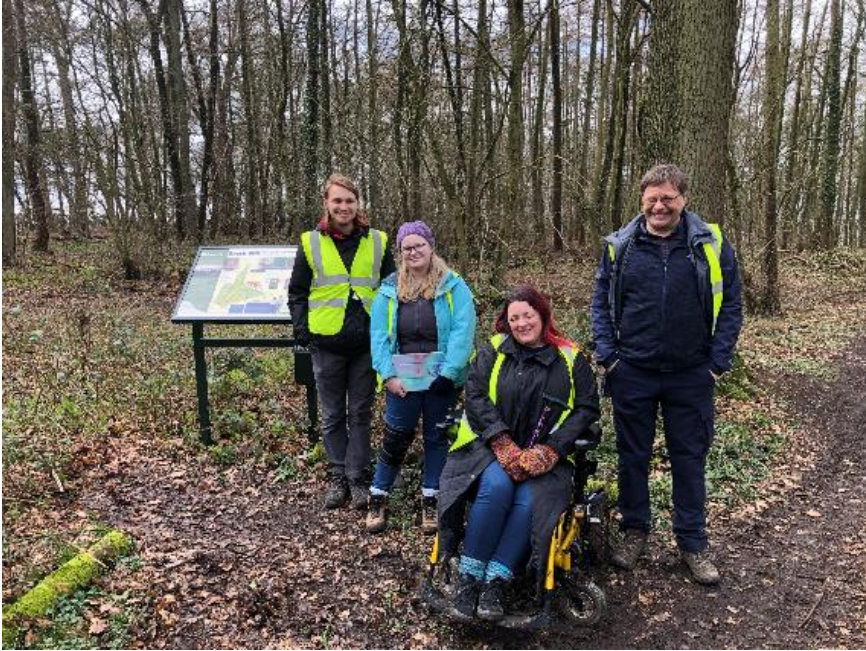
Staff and volunteers from the Bucks Disability Service conducting accessibility surveys at four popular countryside locations