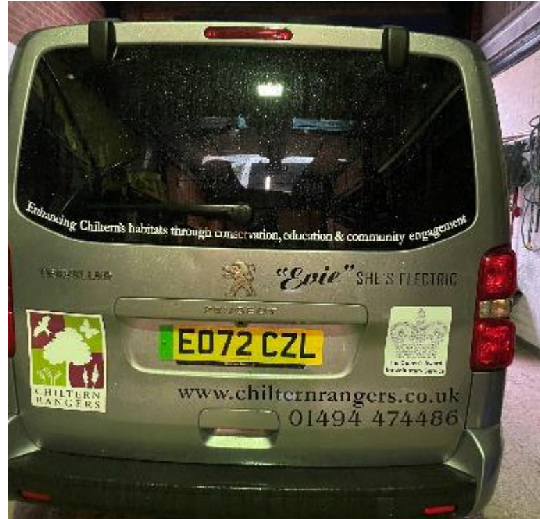
"Evie" electric vehicle transporting conservation volunteers with dementia, limited mobility and other restrictions. Supporting access to conservation volunteering. Will enable 200-300 more volunteers to be transported pa.