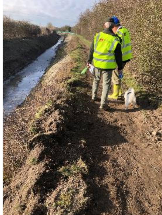
Contributing to resurfacing and accessibility improvements on the Wendover Canal towpath